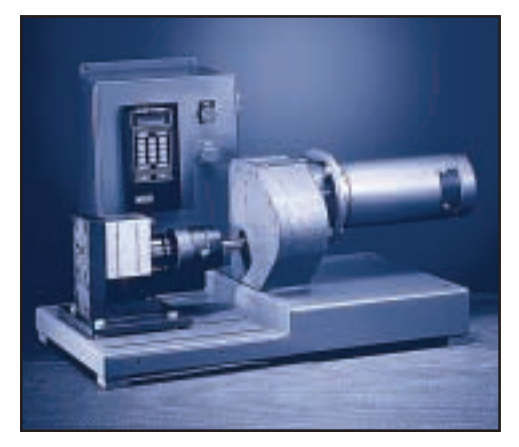
Standard ZeDRIVE with 1/2 hp QM and rear-port HMB pumps.

In 1926, Zenith Pumps was approached by the synthetic fiber industry to design a pump to provide a precise, pulseless, repeatable flow and assure better quality control. The options then were the same as those in the chemical process industry