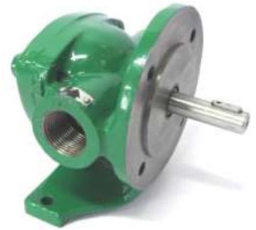
ROTARY TROCHOIDAL PUMP