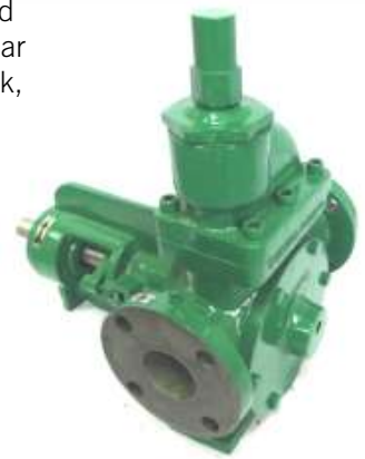
SHUTTLE BLOCK PUMP