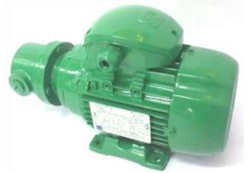
ROTARY TROCHOIDAL PUMP